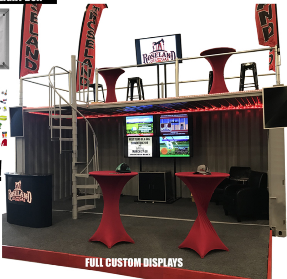
FULL CUSTOM DISPLAYS