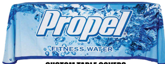
CUSTOM TABLE COVERS