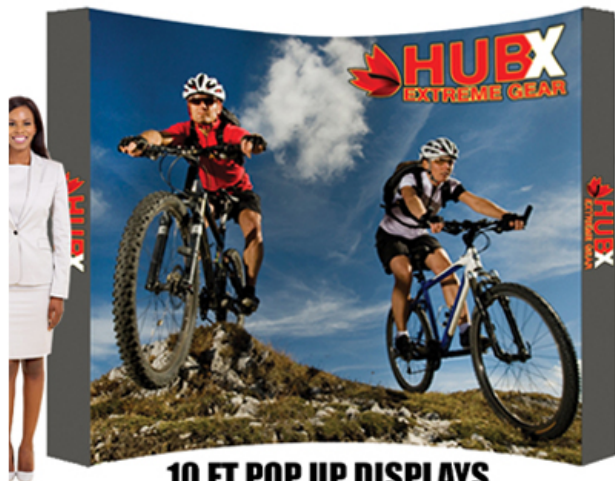
10 FT POP UP DISPLAYS