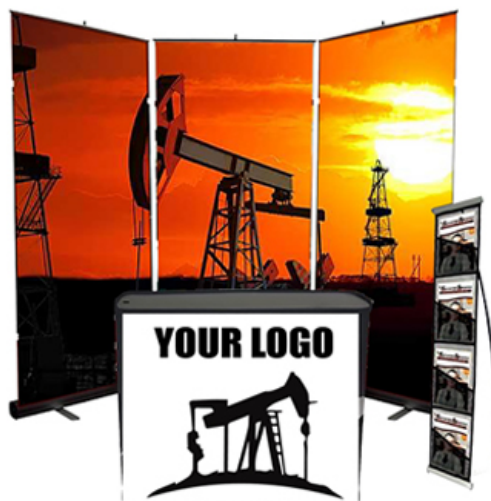
COMPLETE BOOTH KITS