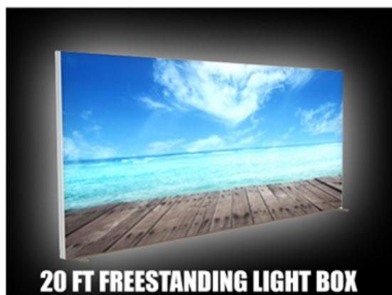
20 FT FREESTANDING LIGHT BOX